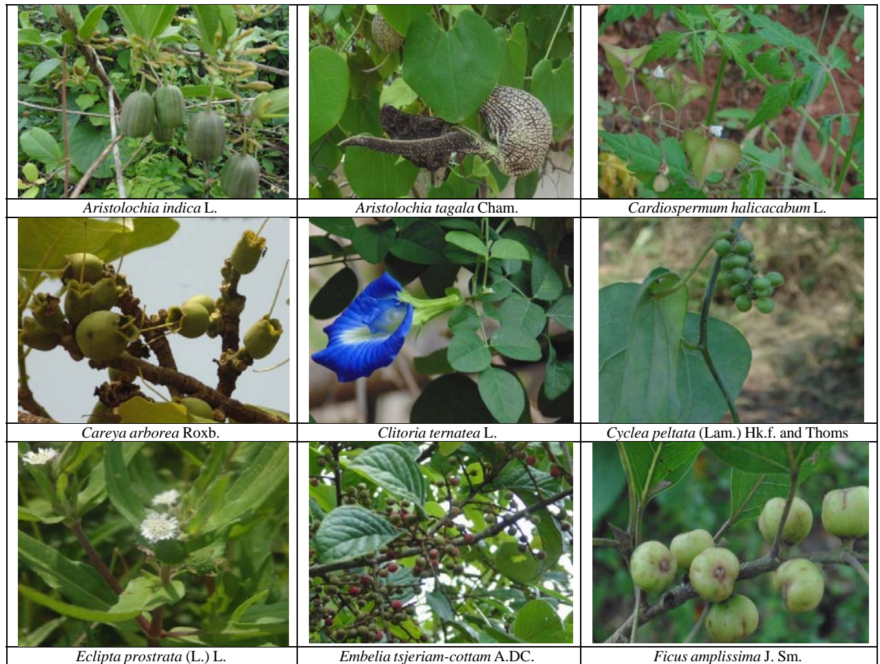
Plate 1: Wild Medicinal plants of Hassan district, Karnataka