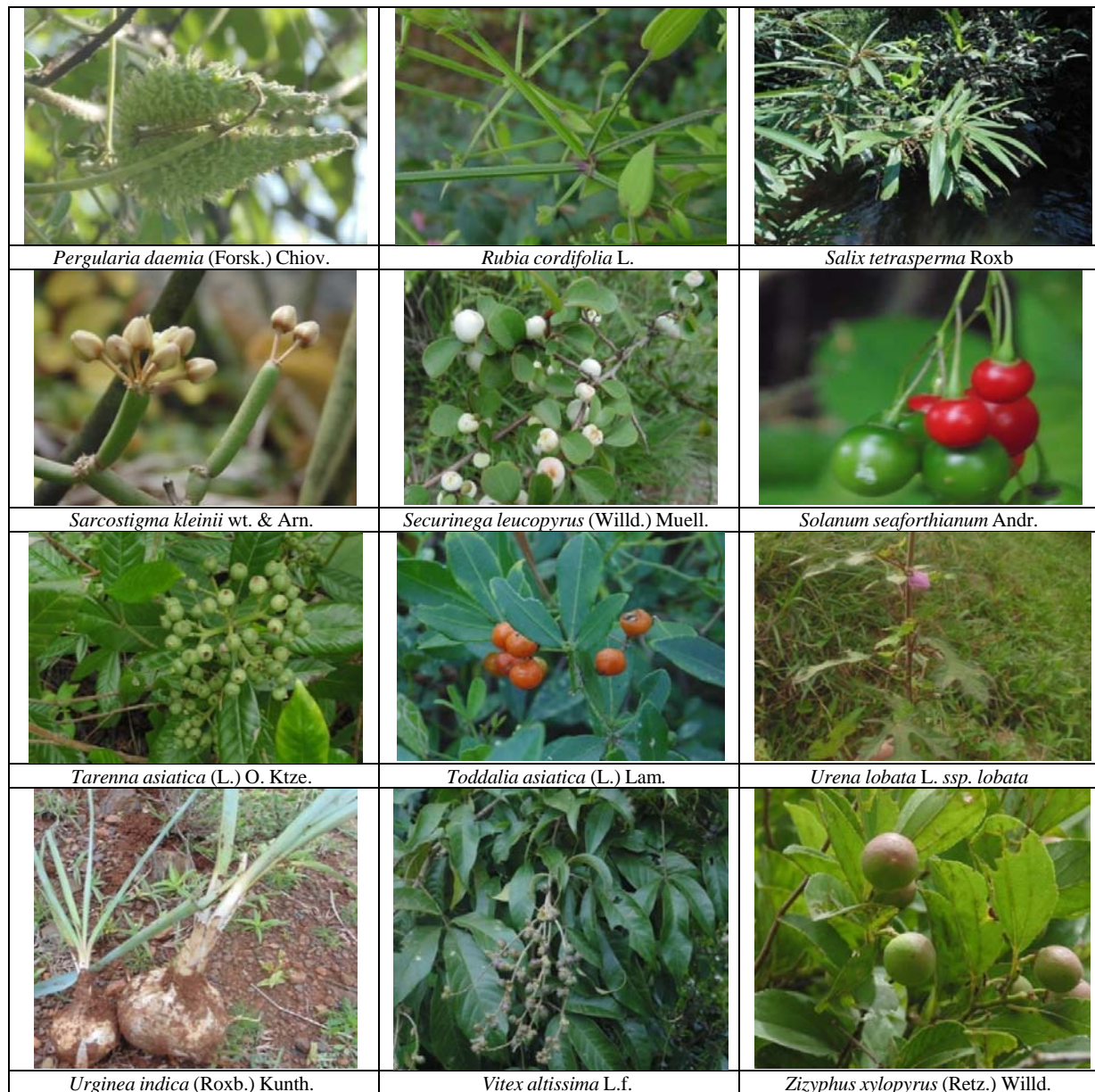
Plate 3: Wild Medicinal plants of Hassan district, Karnataka