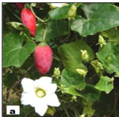
Fig 1: C. indica twigs growing in wild condition

Agartala. The plant was identified consulting authentic floristic literatures like Flora of Tripura [12], Flora of Assam [13] and Flora of British-India [14]. Cross examination of the specie was done consulting with Dr. Nalini Kanta Chakraborty, Ex-Reader, Department of Botany, M. B. B. College, Agartala. Finally, voucher specimen was prepared following conventional methods [15] deposited in the Departmental Herbarium.