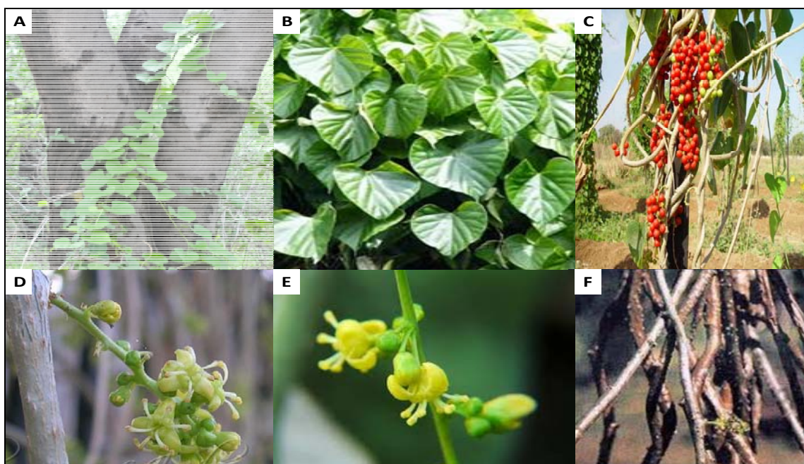
Fig 1: Morphology of different parts of T. cordifolia A. Stem, B. Leaf, C. Fruit, D. Inflorescence, E. Flower, F. Aerial Roots

long, 7 nerved and deeply cordate at the base and membranous [9] (Figure 1B).