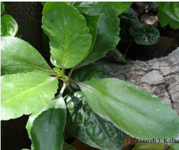
Fig 9: Bryophyllum calycinum