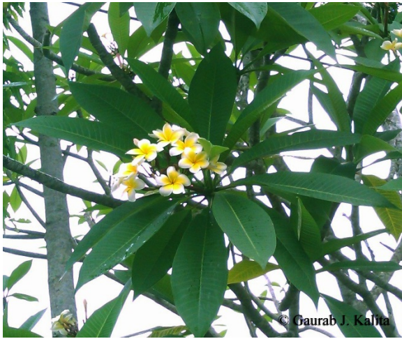
Fig 19: Plumeria rubra