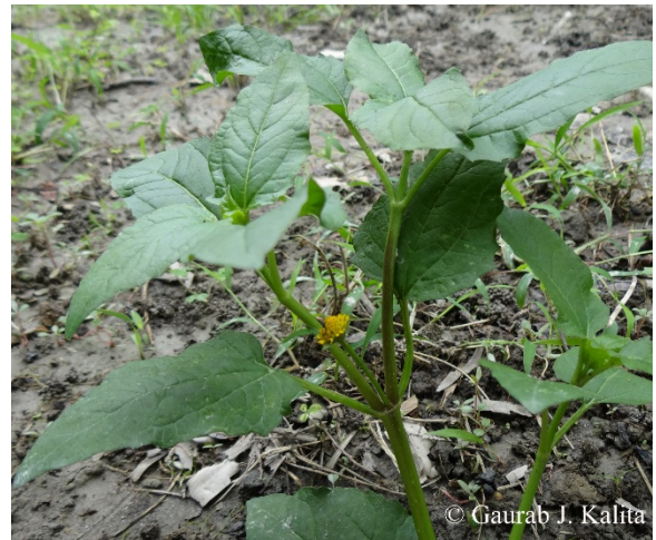
Fig 17: Spilanthes paniculata