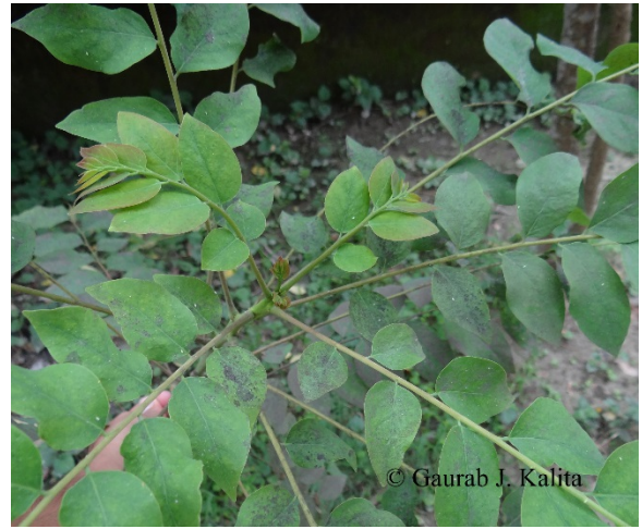
Fig 20: Phyllanthus acidus