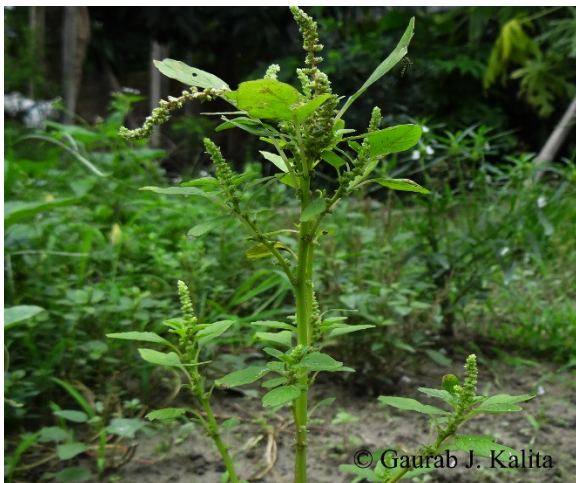
Fig 4: Amaranthus spinosus