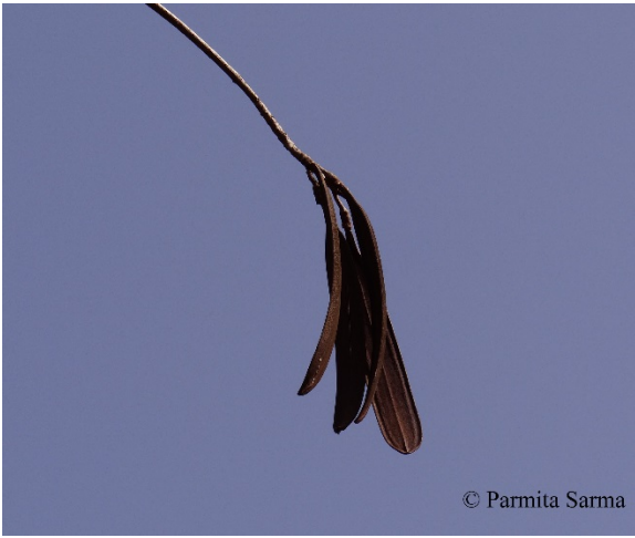
Fig 13: Oroxylum indicum