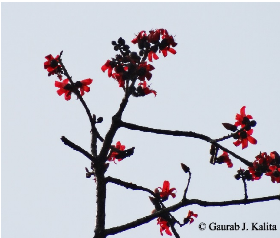
Fig 8: Bombax ceiba