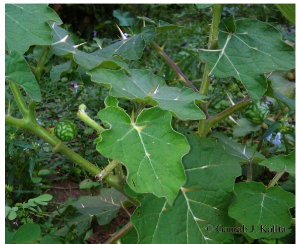
Fig 18: Solanum xanthocarpum