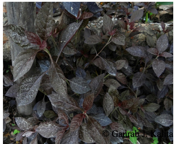
Fig 5: Amarantus bicolor