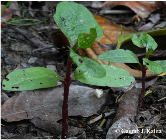
Fig 7: Basella alba