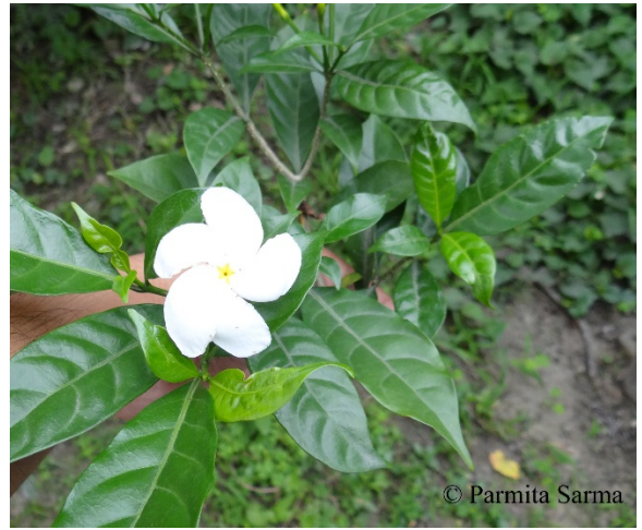
Fig 16: Tabernaemontana coronaria