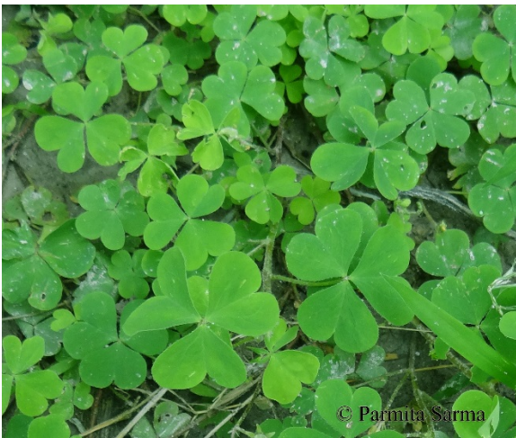
Fig 14: Oxalis corniculata