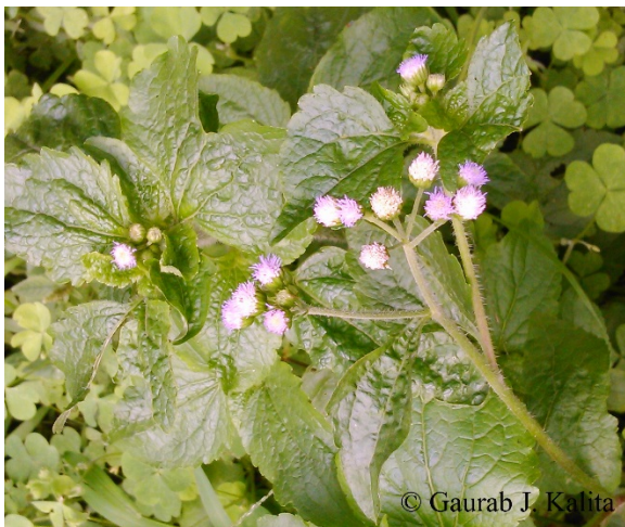
Fig 3: Ageratum conyzoides