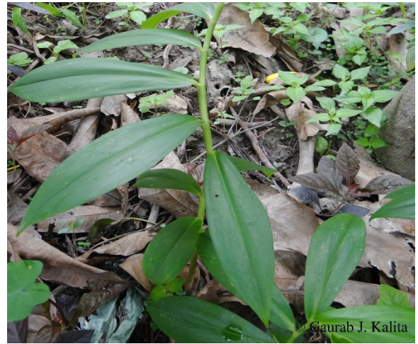
Fig 11: Costus speciosus