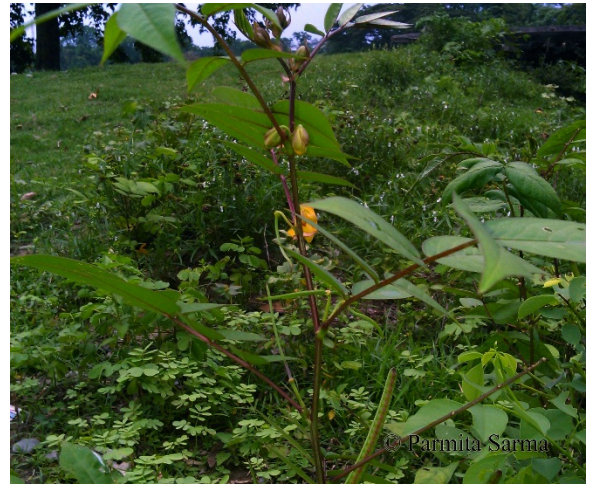
Fig 10: Cassia occidentalis