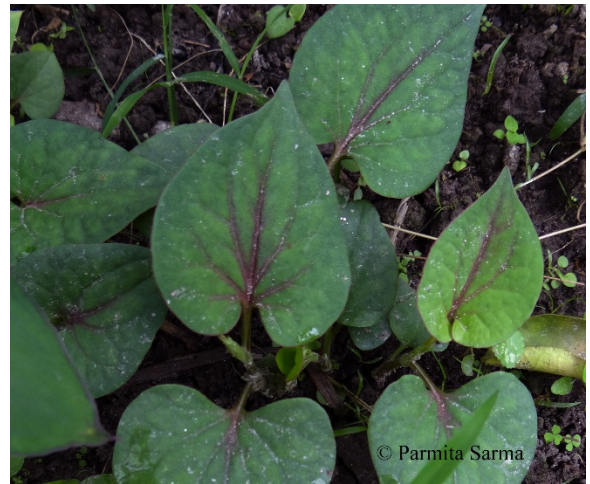
Fig 12: Houttuynia cordata