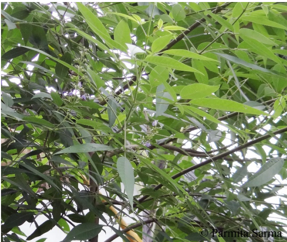
Fig 15: Vitex negundo