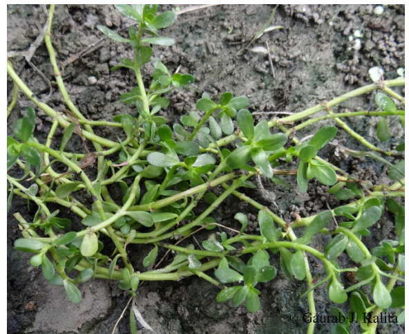
Fig 6: Bacopa monnieri