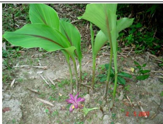
Plate 6. Curcuma zedoaria Rosc.