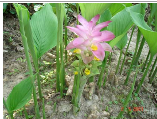
Plate 4. Curcuma leucorrhiza Roxb.