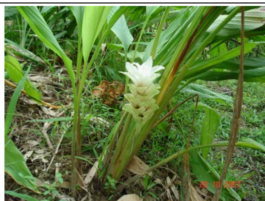
Plate 5. Curcuma longa L.