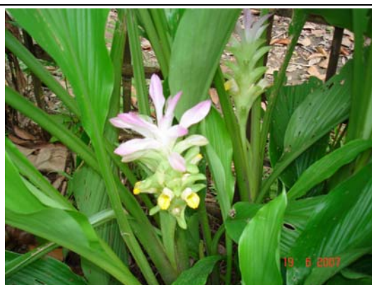
Plate 2. Curcuma angustifolia Roxb.