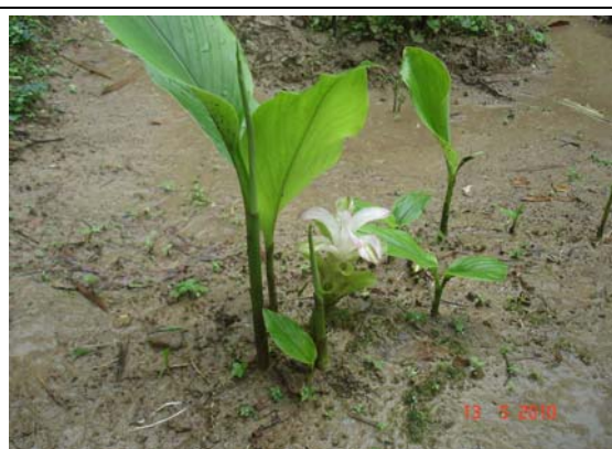
Plate 1. Curcuma amada Roxb.

In conclusion, since time immemorial turmeric ( C. longa ) has been used as medicine for the treatment of various diseases, colorant and food additive. Presence of all the secondary metabolites under study having higher amount of curcumins is found to be impressive. In case of C. amada , C. angustifolia , C. caesia , C. leucorrhiza and C. zedoaria , however, some members showed lower level of curcumin contents (8mg/100g, 11mg/100g and 15mg/100g in C. caesia , C. amada and C. leucorrhiza respectively in comparison to 125mg/100g in C. longa ); moreover, presence of most of the studied secondary metabolites is found to be encouraging and indicates the therapeutic potential of the species.