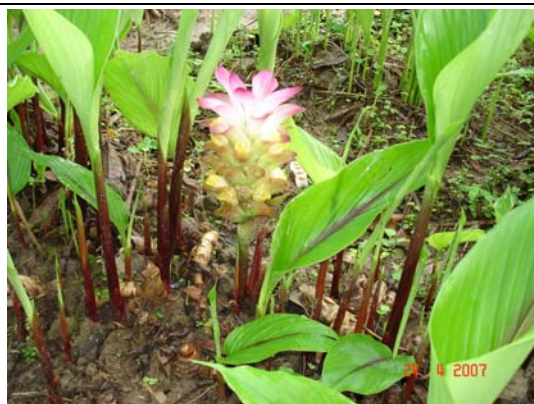
Plate 3. Curcuma caesia Roxb.