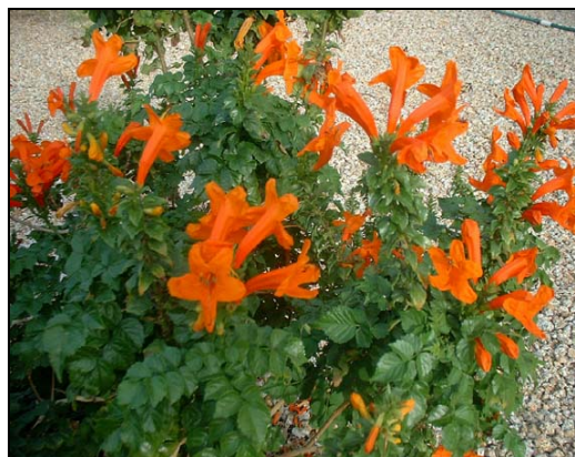
E) Tecomaria capensis (Thunb.) Spach.