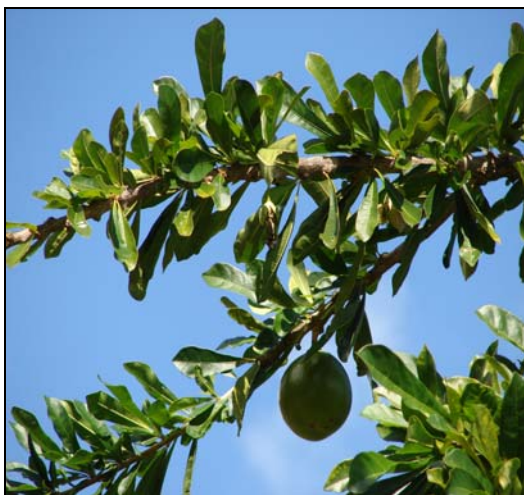
A) Crescentia cujete L.