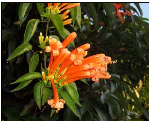
A) Pyrostegia venusta (Ker-Gawl) Miers