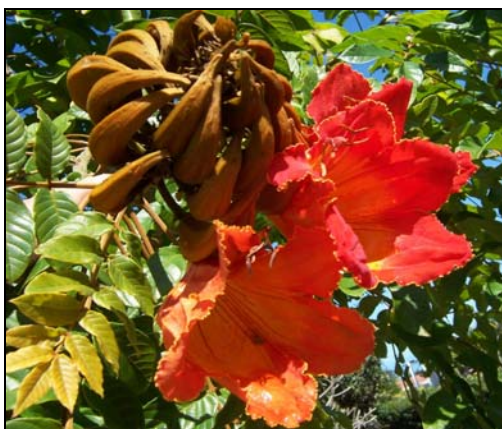
B) Spathodea campanulata P. Beauv.