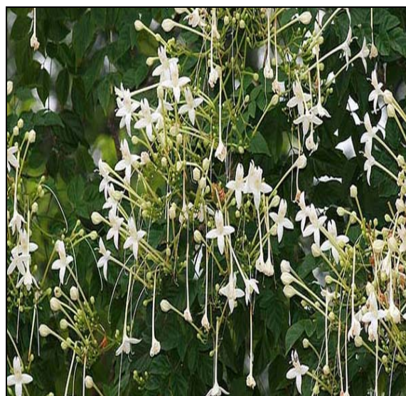
E) Millingtonia hortensis L.