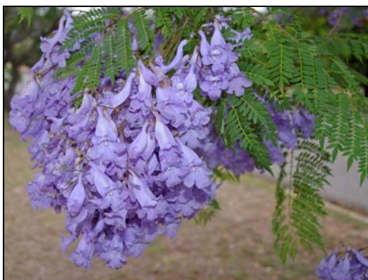
B) Jacaranda mimosifolia D. Don.