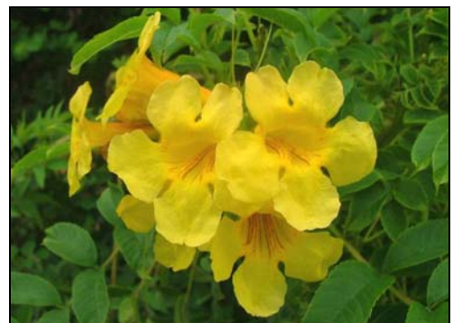
D) Tecoma stans (L.) Kunth.