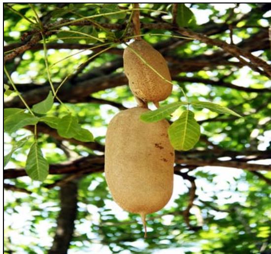
C) Kigelia africana (Lam.) Benth.