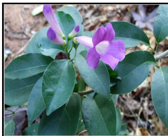
D) Mansoa alliace Miers.