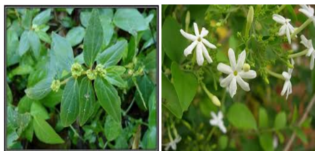
Euphorbia hirta L.