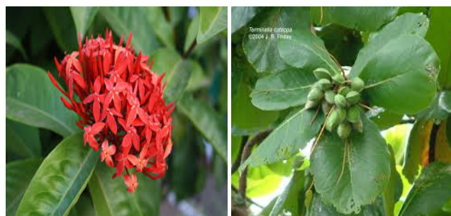
Ixora coccinea L.