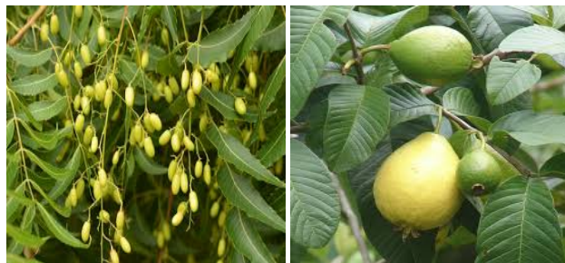
Azadirachta indica A. Juss.