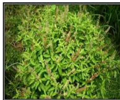
Ocimum sanctum L.