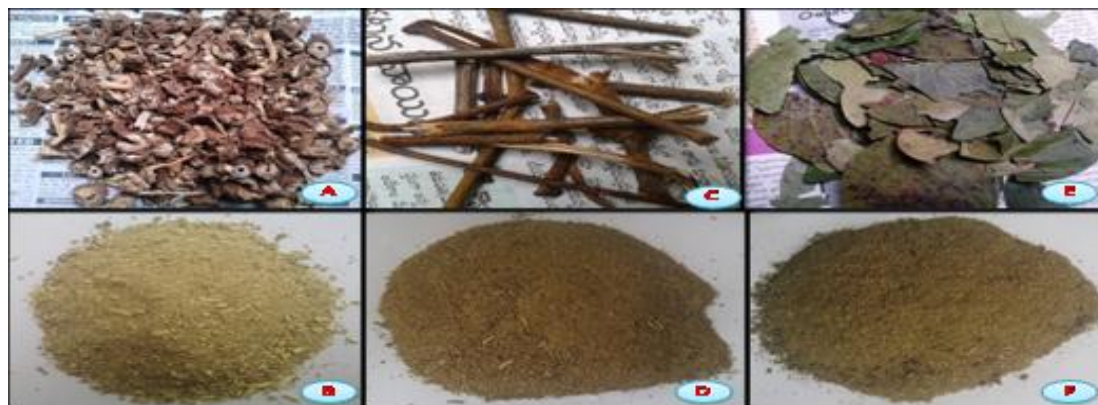
Fig 2: A&B: Roots and Dried powder, C&D: Stem and Dried powder and E&F: Leaves and Dried powder.

The root, stem and leaf samples were washed thoroughly under running tap water to remove soil particles and finally washed with sterile distilled water. These samples were shade dried and ground in to fine powder (Fig-2). The powdered materials were stored in air tight polythene bags until use. 25 gm of powdered material was extracted by Soxhlet apparatus with 100 ml of methanol. The extract was then filtered through Whatman no 41 filter paper and the filtrate was concentrated through evaporation using rotary evaporator at 50°C. One gram of the extract diluted with 100 ml of methanol and this solution was employed in phytochemical analysis and antibacterial activity.