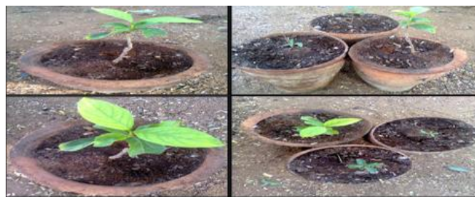
Fig 1: Decalepis hamiltonii planted in Botanical garden, Department of Botany, University College of Science, Saifabad, Osmania University, Hyderabad.

Collection of Plant Material: The plant material collected from Sheshachalam hills, Tirupathi, Chittoor District, Andhra Pradesh. Plant was identified and authenticated at Plant Anatomy and Taxonomy Laboratory, Department of Botany, Sri Venkateshwar University, Tirupathi, Andhra Pradesh and conserved in Botanical garden Department of Botany, Osmania University, Telangana. The healthy root, stem, and leaves were brought to the lab, and maintained at Microbial Physiology lab, Department of Botany, University College of Science, Saifabad, Osmania University, Hyderabad, India (Fig 1).