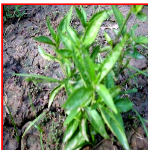
Fig 2: Carica papaya L. (Local name: Pepe)