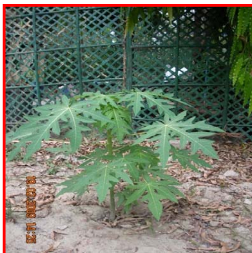
Fig 1: Andrographis paniculata Burn. F. (Local name: Kalmegh)