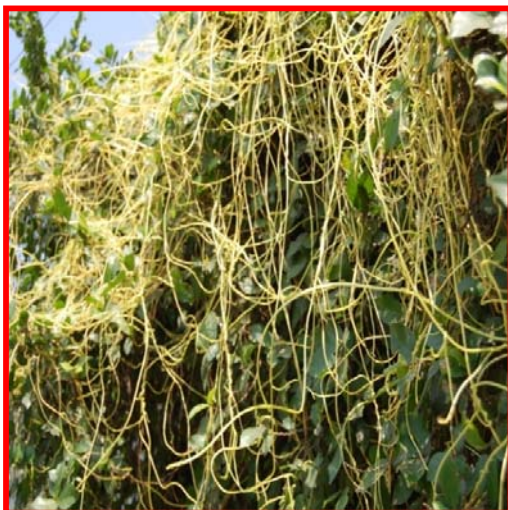
Fig 3: Cuscuta reflexa Roxb. (Local name: Sarnalata)