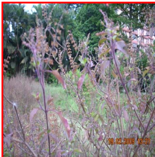
Fig 4: Ocimum calamendrus cerium. (Local name: Krishnatulsi)