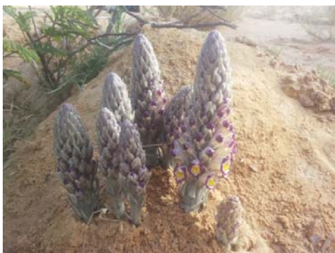
Cistanche tinctoria (forssk.) Beck.

inhalation, ointment, herb tea) and administered through various routes (oral, dermal, nasal and other body parts). However, plant part (s) and homogenizing it in water are the commonly used form of herbal preparation for both human. The oral administration which regrouped the major form of usage, which was in form of drink, was most exercised.