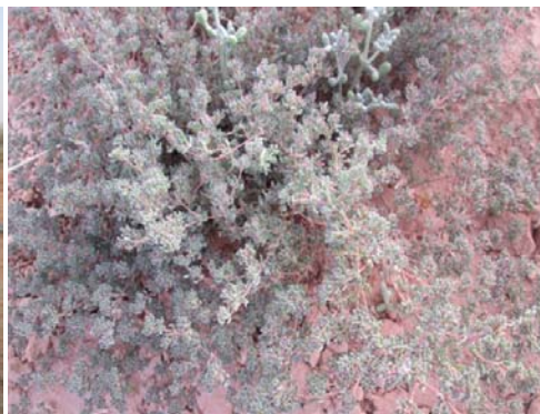
Fagonia glutinosa Delile.