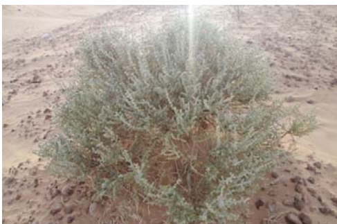
Salsola tetragona Del.