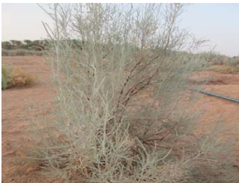
Limoniastrum guyonianum Coss & Dur.