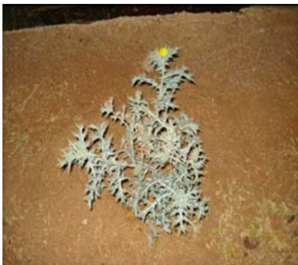
Fig 1: Argemone mexicana plant.

The microorganisms were authenticated, collected from MRMC Gulbarga, Karnataka, India and maintained on Potato Dextrose Agar media and Nutrient agar media. The fungi and bacteria used were selected because they have been implicated with skin, oral and intestinal tract, urinary tract of man. Two dermatophytic fungi namely Trichophyton rubrum , Microsporum gypseum , dimorphic fungi such as Candida albicans , and saprophytic fungi like Aspergillus flavus , Aspergillus niger and pathogenic bacteria like, Staphylococcus aureus , E. coli , Bacillus subtilis .