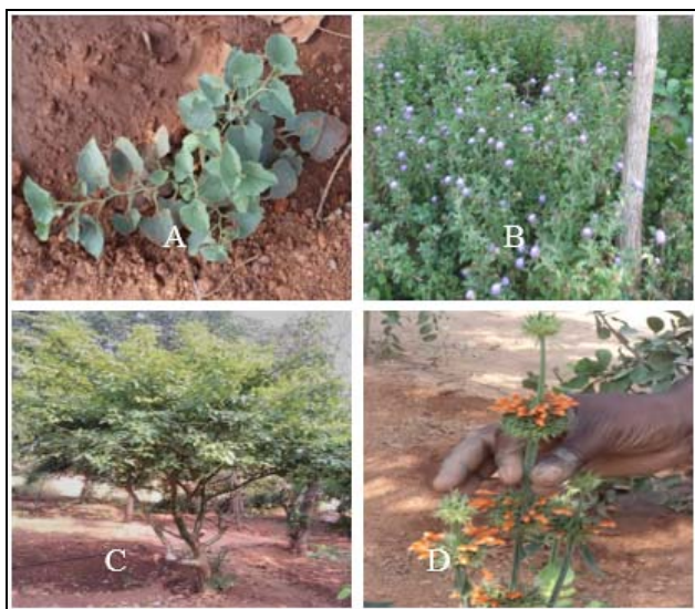
Fig 4: Field experimental site for cultivation and conservation of MPs. (A) Aristolochia bracteata (B) Centrathrum punctatum (C) Commiphora caudata (D) Leonotis nepetifolia