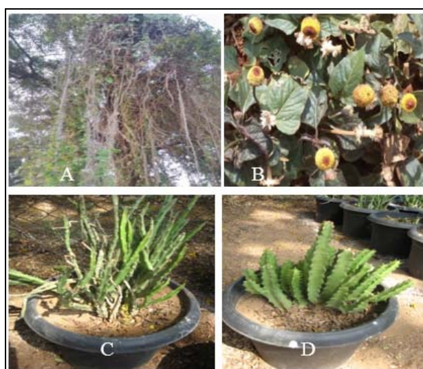
Fig 3: Field experimental site for cultivation and conservation of MPs. (A) Tinospora cordifolia (B) Spilanthes acmella (C) Caralluma fimbriata (D) Caralluma umbellata