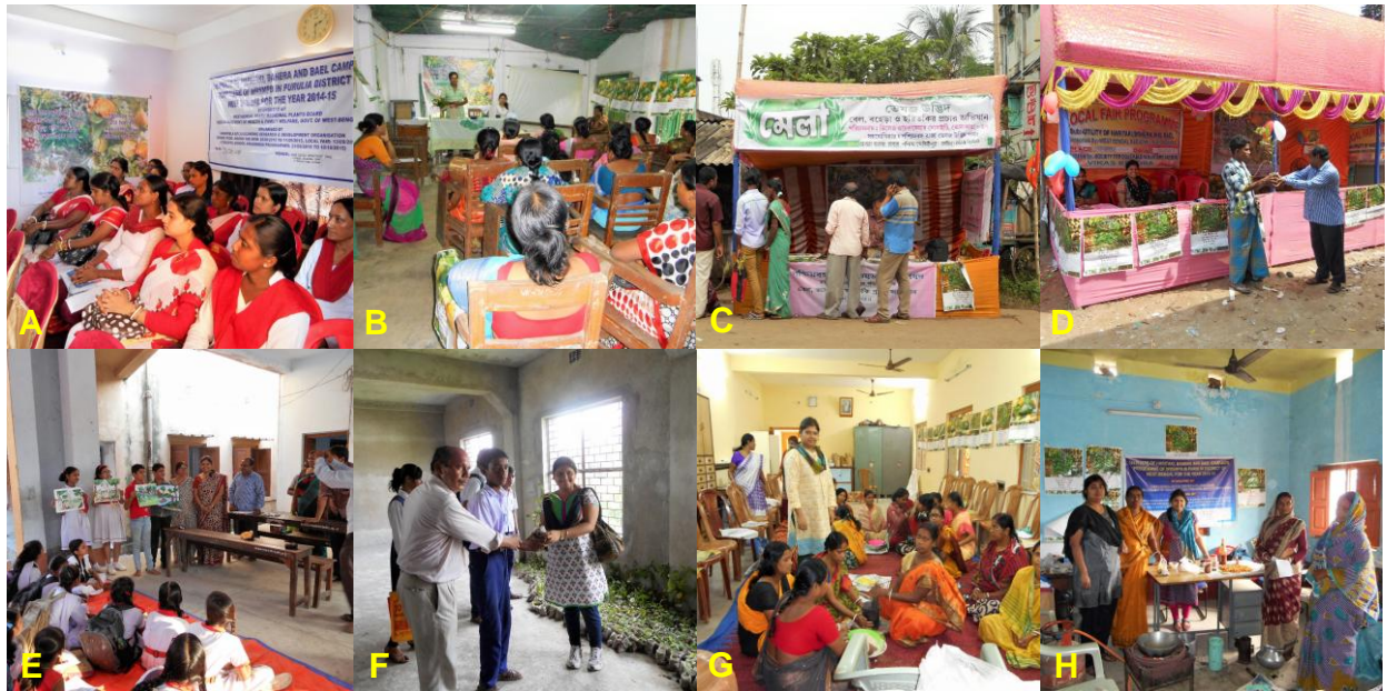
Fig 1: Different social events organized by the six NGOs during '1 st Phase of Haritaki, Bohera & Bael Programme'. A-B: Anganwadi Training, C-D: Local Fair, E-F: School Awareness, G-H: Value Addition programmes

The WBSMPB had initiated training programme with one day duration for awareness of Haritaki, Bohera and Bael plants. Six NGOs organized these programmes which were supported by WBSMPB. Each NGO structured four training programmes with participation of 20-30 Anganwadi workers or helpers. It included lectures on benefits of Haritaki, Bohera and Bael, pasting of posters, brochure distribution, training and capacity building programme and distribution of these three plants at the end of the programme. A total of six training programmes for Anganwadi workers / helpers, one from each NGO were monitored and evaluated. Among these, the programme arranged by Deriachak Vidyasagar Social Welfare Organisation was found to be most successful. Other programmers like Society for Equitable Voluntary Actions (SEVA), Khardah Public Cultural & Welfare Association (KPCWA), Dhansimla Socio-Economic Research & Development Organisation were also pleasing. But the performances made by Voice of People and Village Welfare Society were found to be unsatisfactory as compared to other NGOs.