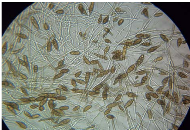
Fig 2: Alternaria solani under microscope (x 40)

The results of the effect of aqueous extract of henna on the mycelia growth of Alternaria solani on Petri plates is represented in the table 01.