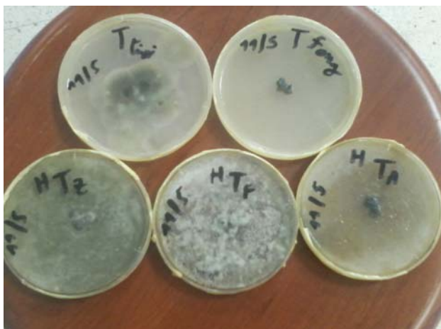
Fig 3: The effect of aqueous extract of henna on the mycelia growth of A. solani

The aqueous extract of L. inermis TA gives considerable antifungal activity at 15 mg/l, the mycelia growth of Alternaria solani was inhibited 100%, the similar effect done with the fungicide. Both of the treatments TZ and TF give moderate effect (54%) and no effect (0%) on mycelia growth inhibition (fig 3)