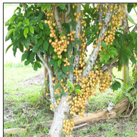
Fig 2 Bearing Burmese grape tree