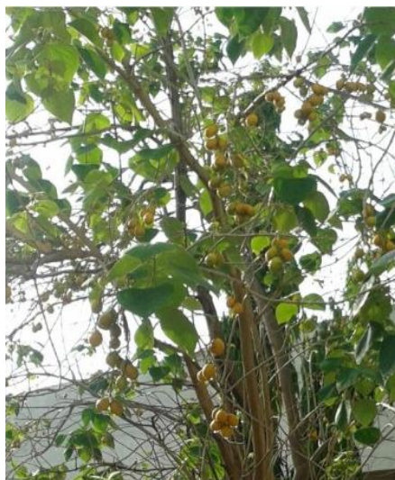
Fig 1: Gmelina arborea plant

Herbal medicines are a crucial element of the expansion of modern civilization. The WHO estimates 80% of the world population currently utilize herbal drug for some aspect of primary health care. Presently, major pharmaceutical companies are conducting huge research on plant materials for their effective therapeutic value. It is estimated that at least 25% of all modern medicines are derived, either directly or indirectly from plants [1, 2] Plant contain various diversified phytoconstituents. The plant is utilized the phytoconstituents for their growth viz. lipid, proteins and carbohydrates are known as primary metabolite. Plant synthesized some constituents from primary metabolite, having complex structure like phenolic, flavonoids, alkaloid, resin, glycoside, tannins and terpenoid are known as secondary metabolite. Plants secondary metabolites are distinctive reserve of biological active medicament.