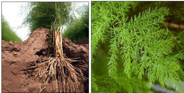
Fig 1: Asparagus racemosus