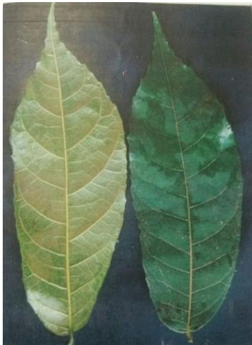
Fig 1: Antiaris toxicaria (Pers.) Lesch. Leaf