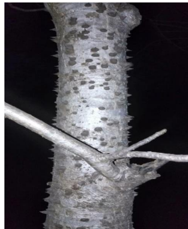
Fig 2: Bombax ceiba L. bark