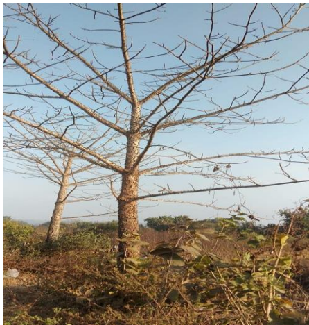
Fig 1: Bombax ceiba L. tree