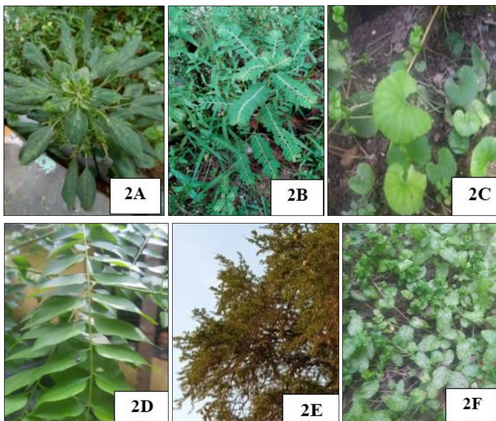
Fig 2: The Plant Samples (2A: Acalypha indica , 2B: Phyllanthus amarus , 2C: Centella asiatica , 2D: Murraya Koenigii , 2E: Limonia acidissima , 2F: Mentha spicata )

freshener and antiseptic mouth rinse [87]. Taking account from a report in the year of 2018, synthesis of silver nanoparticles by aqueous leaf extract of Mentha spicata as reducing and stabilizing agent is possible and it shows an efficient antifungal and antioxidant activity, although a relatively low of concentration of silver nanoparticles has no effect on the red blood cell. The antibacterial activity of developed silver nanoparticles were tested against multidrug resistance Staphylococcus aureus , Escherichia coli , Enterococcus faecalis , Proteus mirabilis and Acinetobacter baumannii (isolated from urinary tract infections in a previous study). The antimicrobial activity of Mentha spicata extract may be caused due to the presence of high content of carvone-rich oils. The in vitro cytotoxic and anticancer activities to those of silver nanoparticles capped with citrate ions and thereafter the cell death induced by synthesized nanoparticles may be through a mechanism different from apoptosis [88, 89].