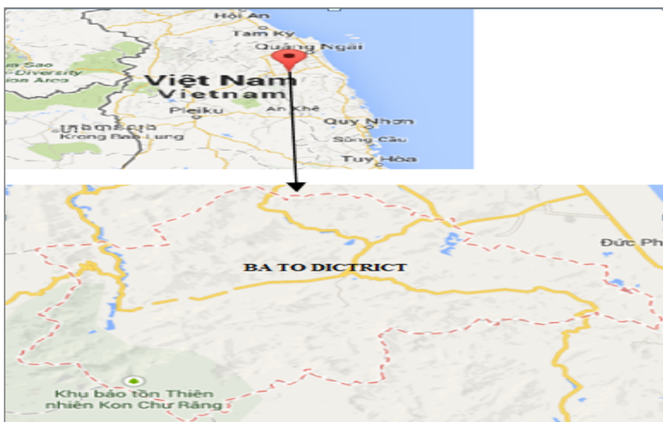
Fig 1: Map of the case study area

The study was conducted in Ba to district, which is found in the west zone of Quang Ngai province, in the South Central Coast region of Vietnam. The study area is located 50 km far from the southwest of Quang Ngai city which is the capital city of Quang Ngai province. The Ba To district is located in an area that is rich in biodiversity