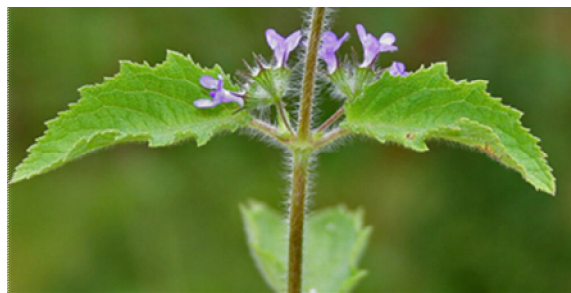
Fig 1: Hyptis suaveolens (L.) Poit